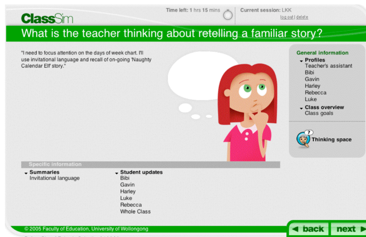
Figure 3: An example of a screen that allows the user to be aware of the teachers' thoughts