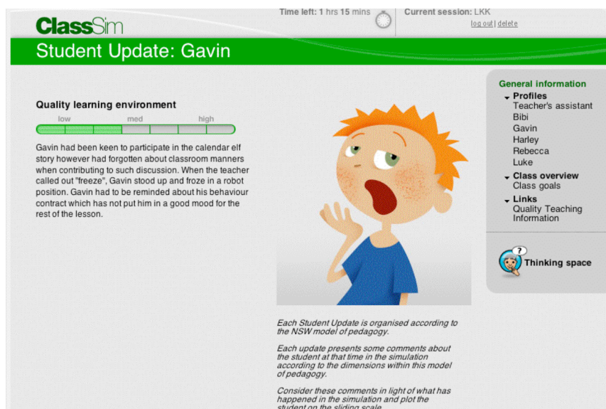
Figure 1: An example of a student update

In the introduction of new teaching and learning experiences the user is able to access ‘teacher thoughts’ pertaining specifically to what is happening in that episode. We believe this provides pre-service teachers with access to detailed commentary from someone on the field. Further, the ability to access commentary provided by an expert for individual targeted children at decisive points in the simulation provides additional access to expert advice. Figure 1 provides an example of such information. The user is able to see a rating of where on the continuum that particular child may be, along with a visual image representing what that child may look like at that time. We spent considerable time developing more than forty facial expressions for individual children within the virtual classroom. As teachers, we were very aware that often the first indication you get as to how engaged a student is, is from looking at their face. With that in mind, the development of a visual representation seemed appropriate to accompany the more descriptive written commentary.